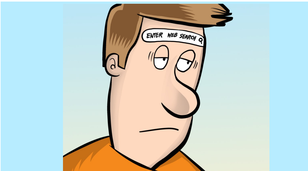
Larry Grew A Unibrowser.

Craft A Story. Tell your story and open up to customers. Stories define who we are, and they can define your business's personality. Forbes, Jan. 27, 2021